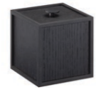
BLACK STAINED ASH BL40103