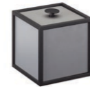
DARK GREY BL40101