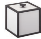
LIGHT GREY BL40102