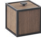
SMOKED OAK BL40106