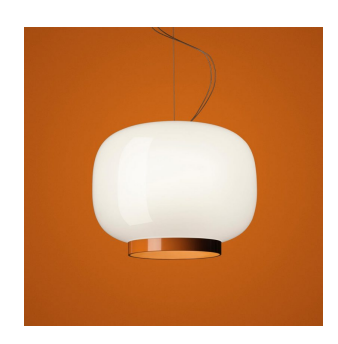
Chouchin Reverse 1