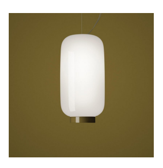
Chouchin Reverse 2