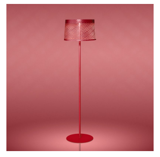
Twiggy Grid Lettura