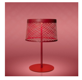
Twiggy Grid XL