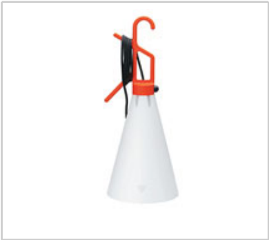
May day design by Konstantin Grcic Utility hand lamp