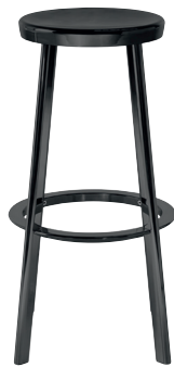
Outdoor matt colour Black 5130