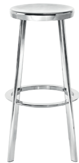
Indoor finish Polished Aluminium