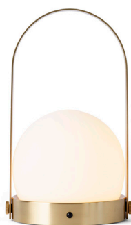
Brushed Brass 4863839