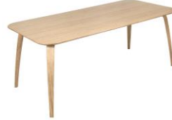
// Oak nature