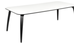
// Black stained ash with white laminate