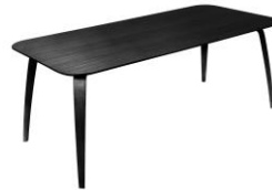
// Black stained ash