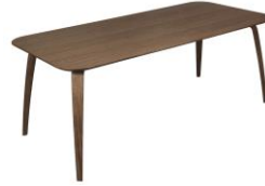
// Walnut nature