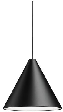
String Light Cone Dali Version designed by FLOS Architectural

General lighting LED module to be installed in The Running Magnet 2.0 System. Built-in DC/DC electronic voltage converter.