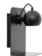
Matt black. Art.no. 104530