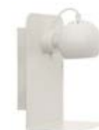
Matt white. Art.no. 104534