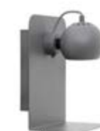
Matt grey. Art.no. 104528