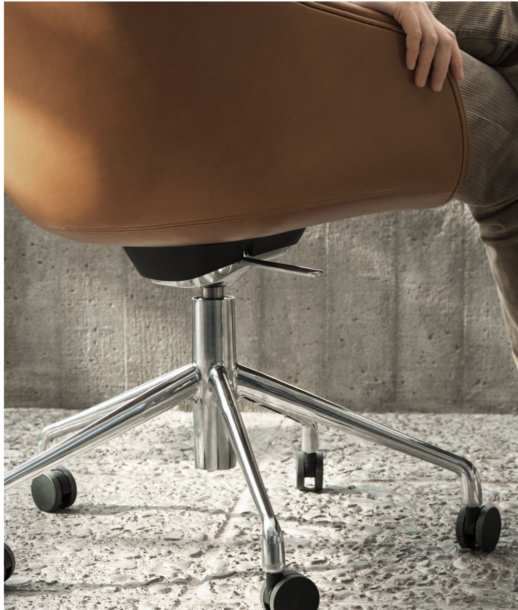
AAC 155, Silk Cognac SIL0250