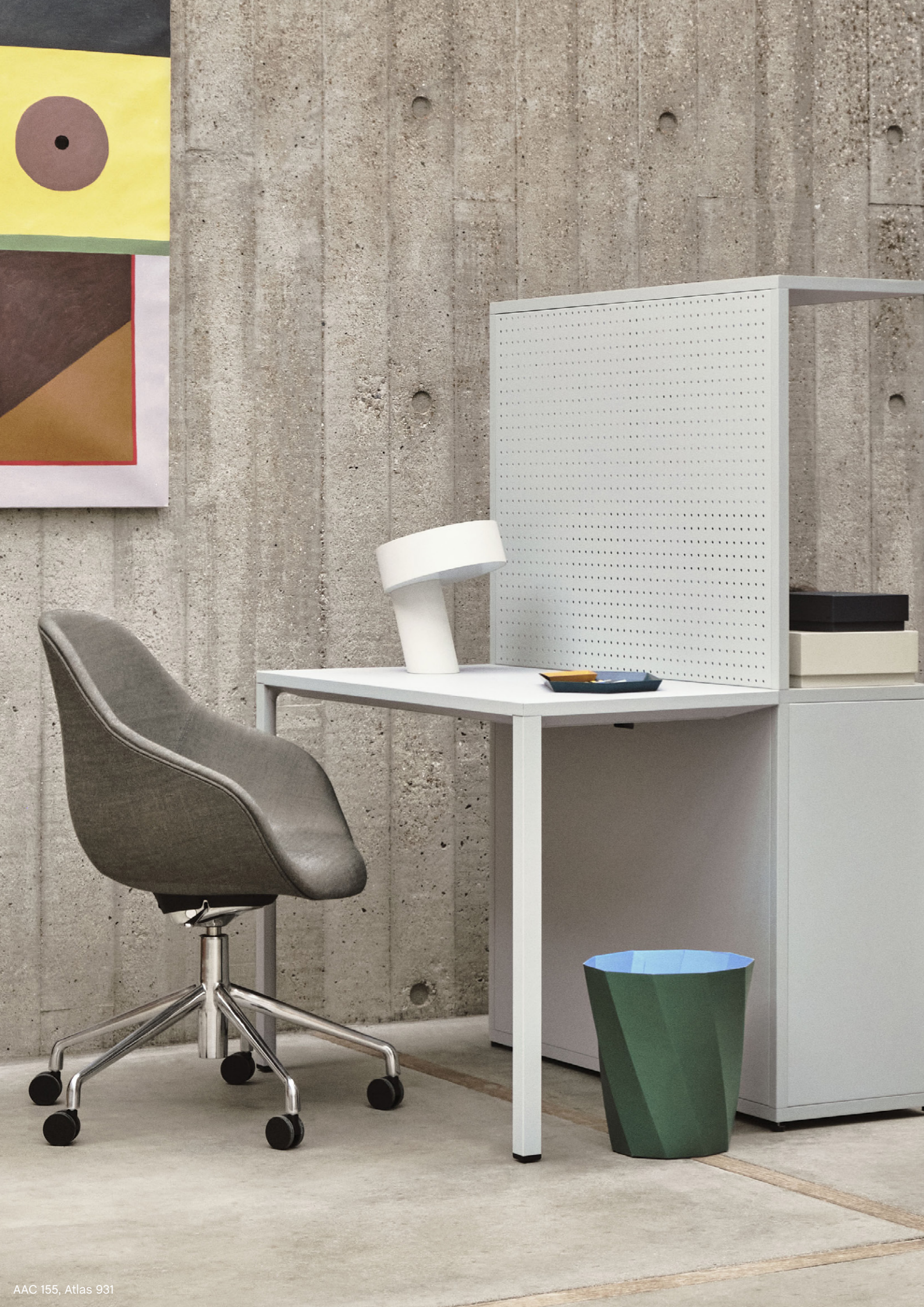
AAC 155, Atlas 931