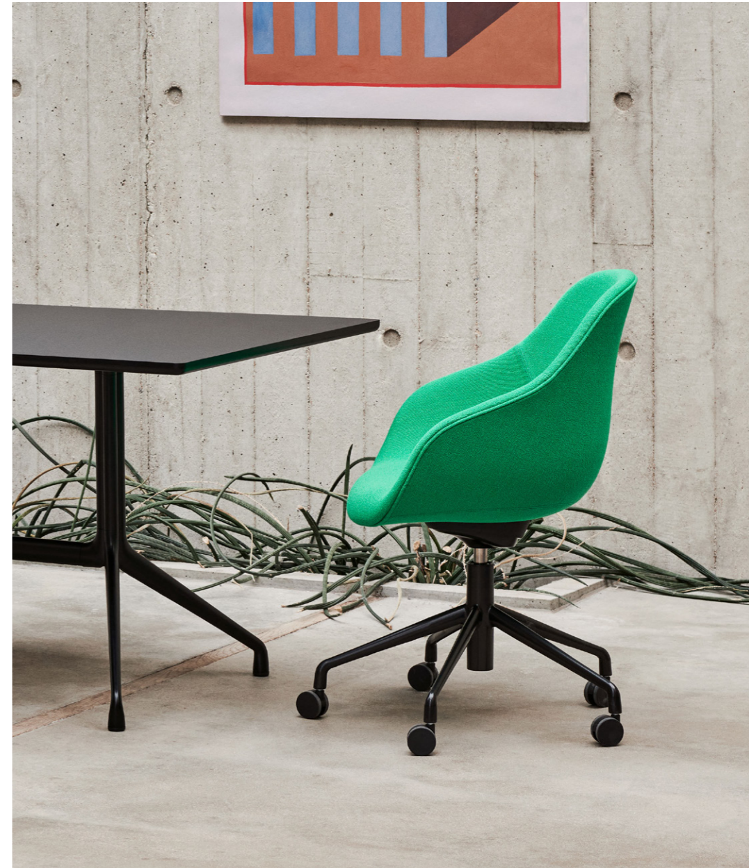
AAC 155, Vidar 932