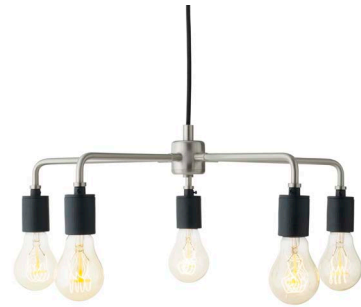
Brushed Steel 1910039