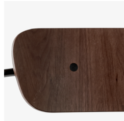
Lacquered walnut with black fitting