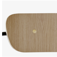
Lacquered oak with black fitting