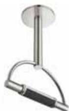
satin nickel-plated retinato cod 507