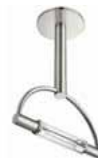
satin nickel-plated trasparente cod 547