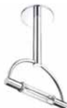
shiny chrome trasparente cod 545