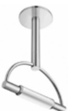
satin chrome opalescente cod 1531