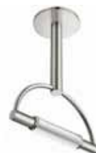
satin nickel-plated opalescente cod 533