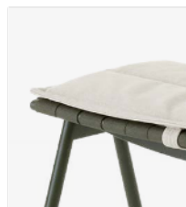
→ Heritage Papyrus