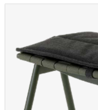
→ Heritage Char