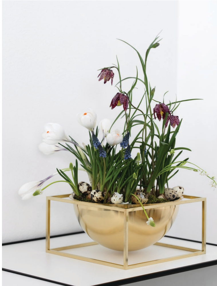
KUBUS BOWL CENTERPIECE Designed by Søren Lassen