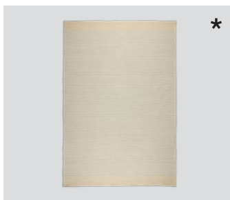
Spool rug 200 x 300 cm grey and yellow – Item no. 3241