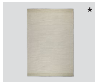
Spool rug 200 x 300 cm grey and green – Item no. 3242

Product type: Indoor and outdoor rug series