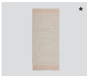
Spool runner 80 x 200 cm grey and red – Item no. 3250