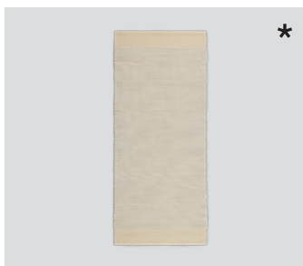
Spool runner 80 x 200 cm grey and yellow – Item no. 3251