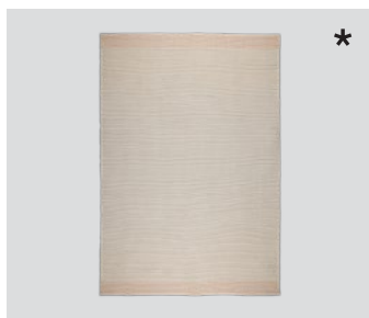
Spool rug 200 x 300 cm grey and red – Item no. 3240