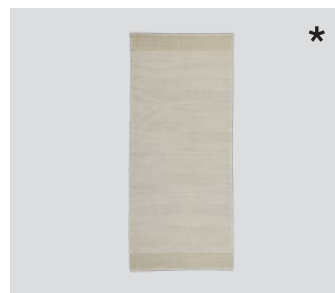
Spool runner 80 x 200 cm grey and green – Item no. 3252