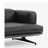
Noble Black Leather