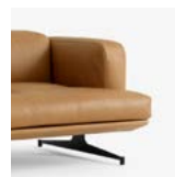
→ Noble Cognac leather